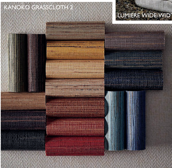
KANOKO GRASSCLOTH 2

A Hemp grasscloth wallcovering in 17 colours to include a broad range of bright and neutral shades.