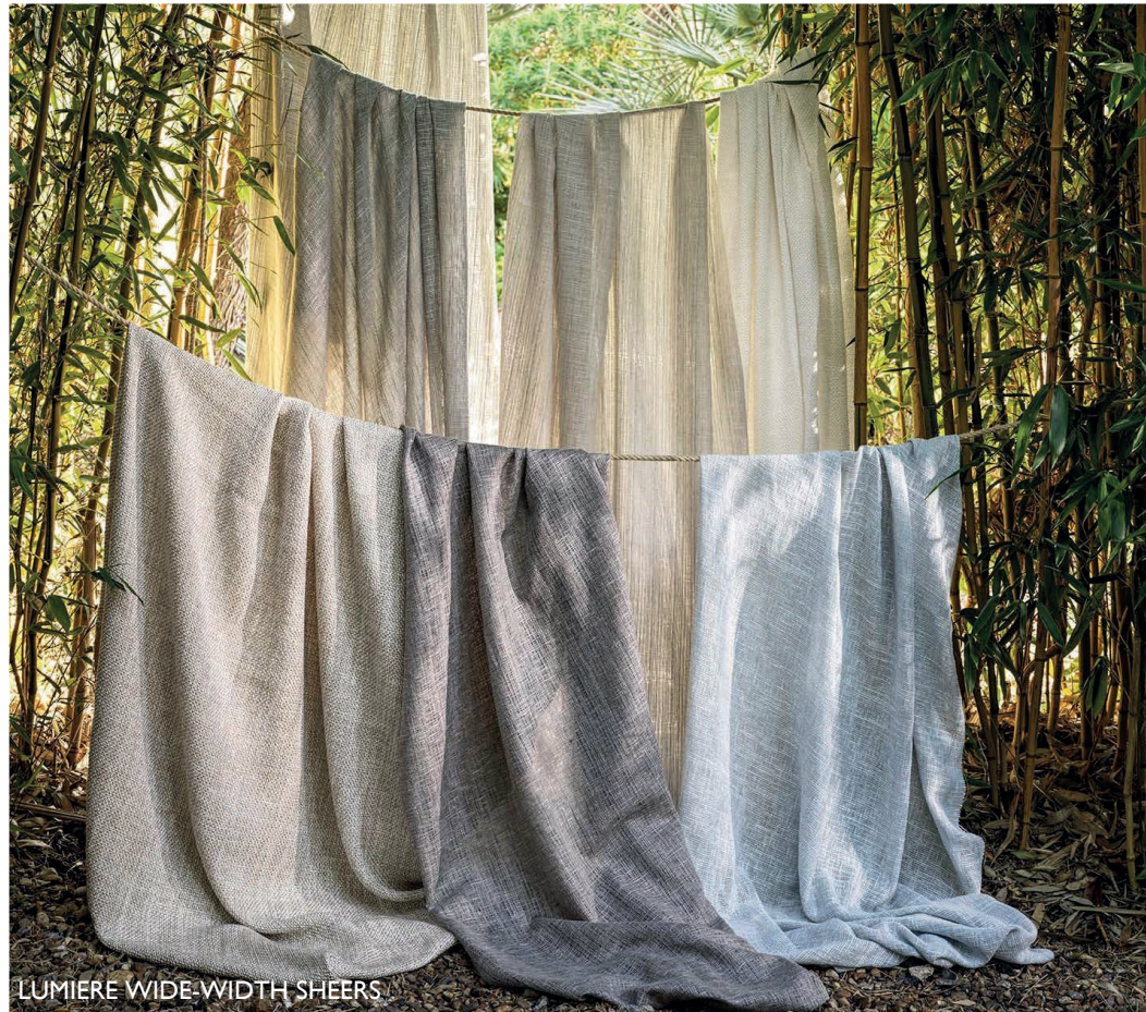
LUMIERE WIDE-WIDTH SHEERS

A soft luxurious upholstery fabric woven with spray-dyed chenille yarns is presented in 21 lively colours.